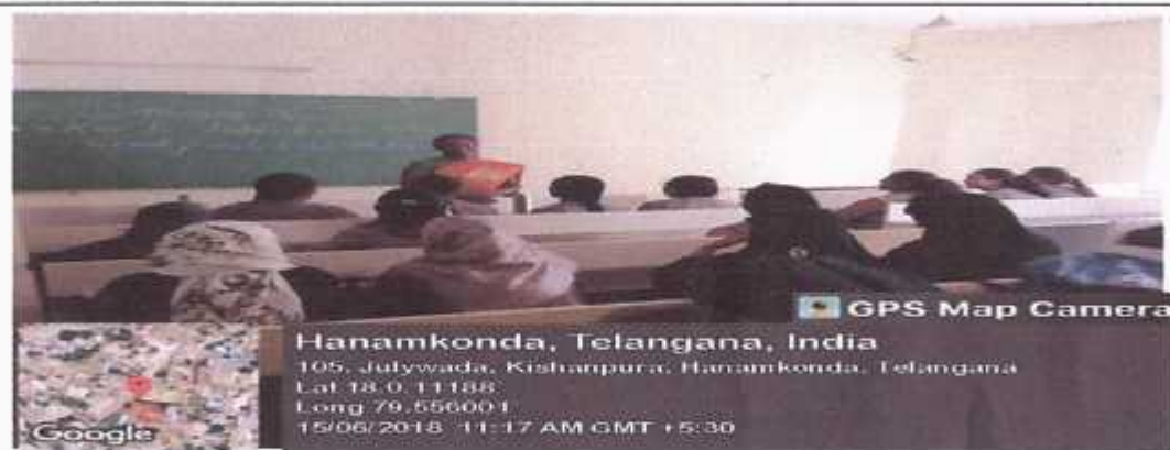
How to Tackle Issues in Cyber Security and Social Media